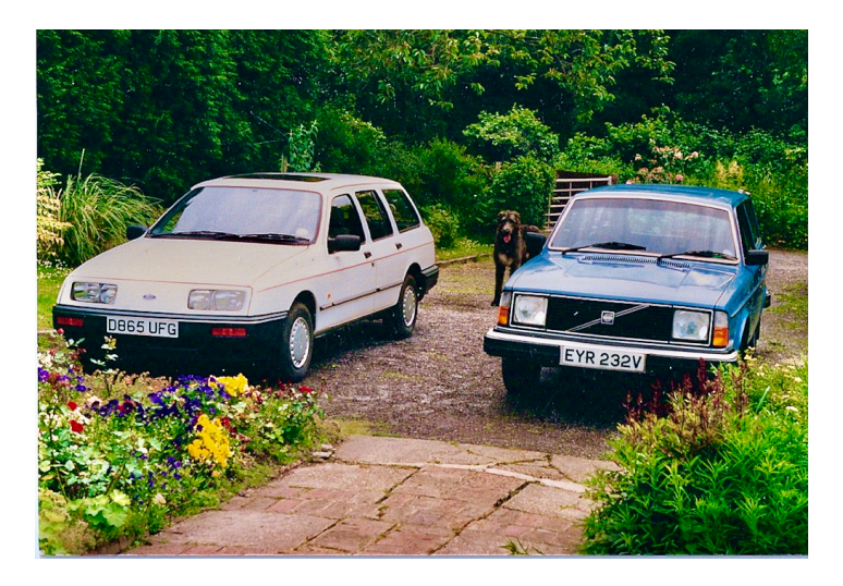
Rollo choosing his estate car

There was one drawback though - Rollo did fit in the back of the car- just, but for longer journeys his moving about in the back of the car made the car more unstable than felt safe so for weekend trips from Sussex to Wales, when he was present, we still used the trusty old Volvo estate that seemed heavy and stable enough to cope with his fidgeting. Oh, and I remember one other potential problem in that the car had proved to be popular with high sales volumes so that it wasn't always easy to find in a car park in among several others. Also locks being less sophisticated than nowadays I once found that I had unlocked and got into 'my' white estate car to find someone had already broken in and left a briefcase and umbrella on the back seat! Getting out guickly I found my car several spaces away and unlocked it and escaped before potential arrest as a car thief.